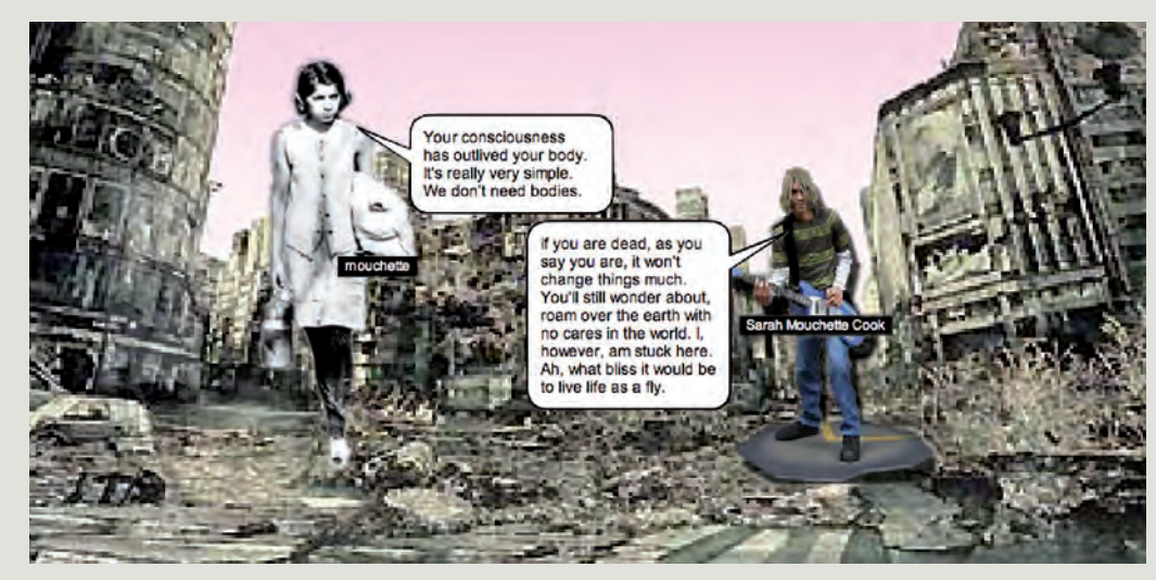
Ghostcity - http://mouchette.org/ghostcity.